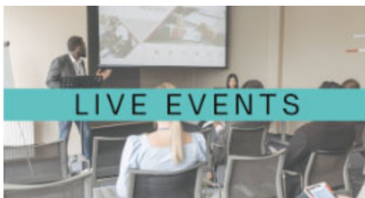
Upcoming In-Person Events