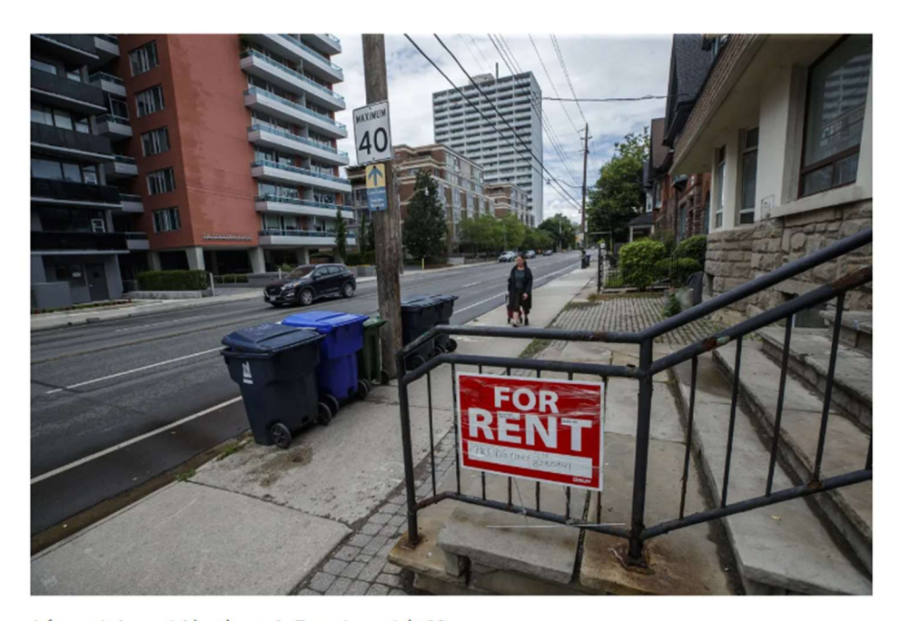
A for rent sign outside a home in Toronto on July 12.

The wealth gap between homeowners and renters is widening and governments should create policies that improve financial outcomes for long-term tenants, Toronto-Dominion Bank <u>TD-T</u> -2.89% decrease said Wednesday in a report.