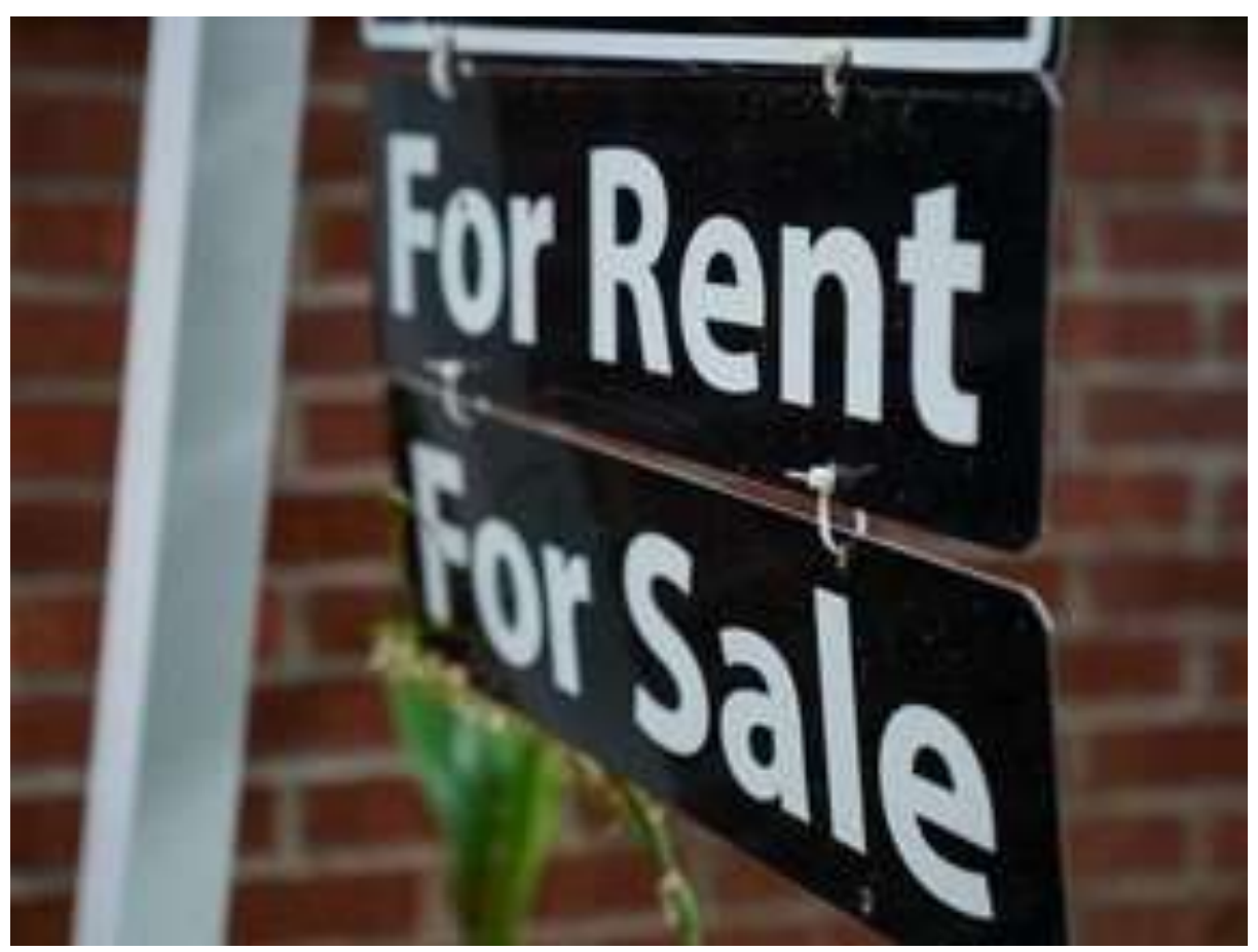
Metro Vancouver rental rates jumped again in November, with the average monthly rent for a one-bedroom apartment breaking $2,300, according to liv.rent, a digital rental platform.

B.C. cities top the list of most expensive places for renters for second month in a row.